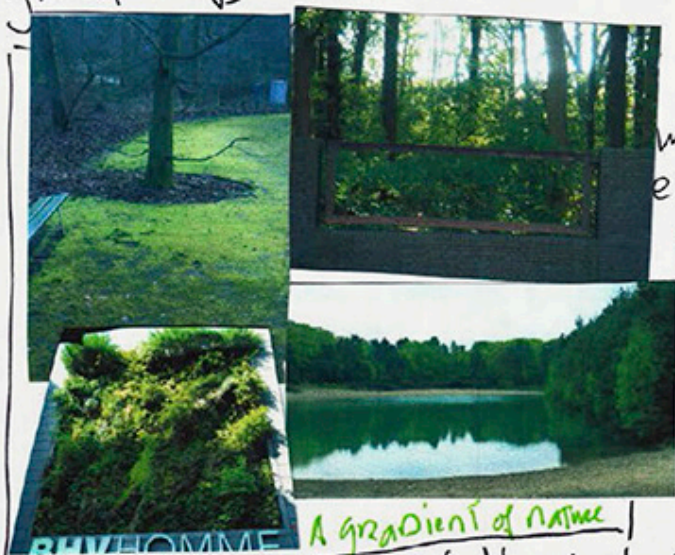
A gradient of nature

Could you make a collage inspired by green?